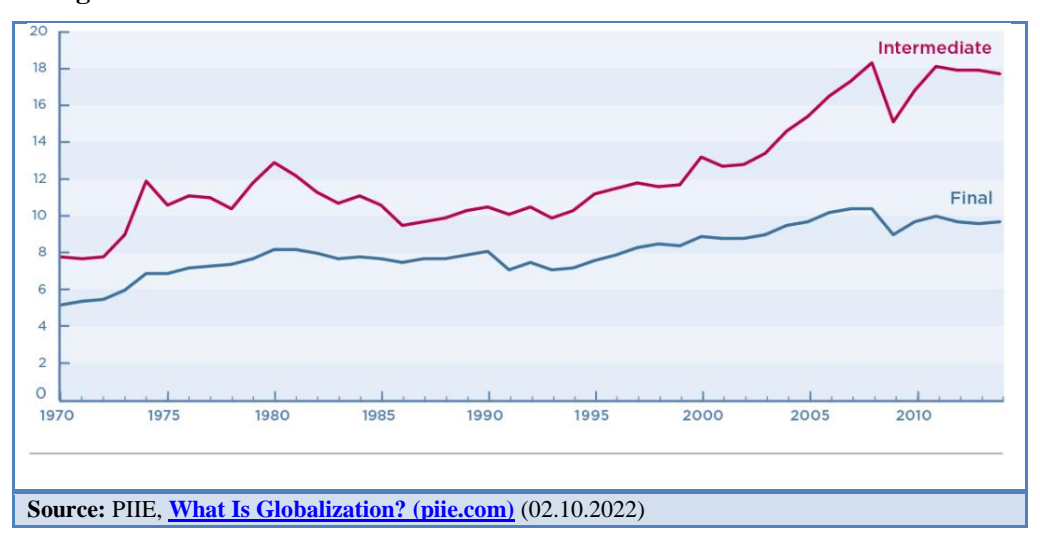
Figure 2. Ratio of Final and Intermediate Goods in the Global Value Chain

involved (Aykaç et al., 2009: 66). As in this example, it is almost impossible for consumers to identify human rights violations in firms that operate in the production of intermediate goods or raw materials that are not directly targeted at consumption. Indeed, as shown in Figure 2, the majority of goods in the global value chain are intermediate goods rather than final goods.