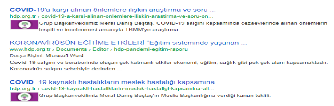
Figure 12. COVID-19 related News from the HDP Website

During the pandemic period, HDP has shared fewer posts on its website than AK Parti and CHP. Similar to CHP, they, in their social sharings, have criticized the ruling AK Parti and responded to the strategies followed during the pandemic. In addition, research on the problems experienced in the social field during the pandemic period and the works done by HDP deputies are also published on the HDP website.