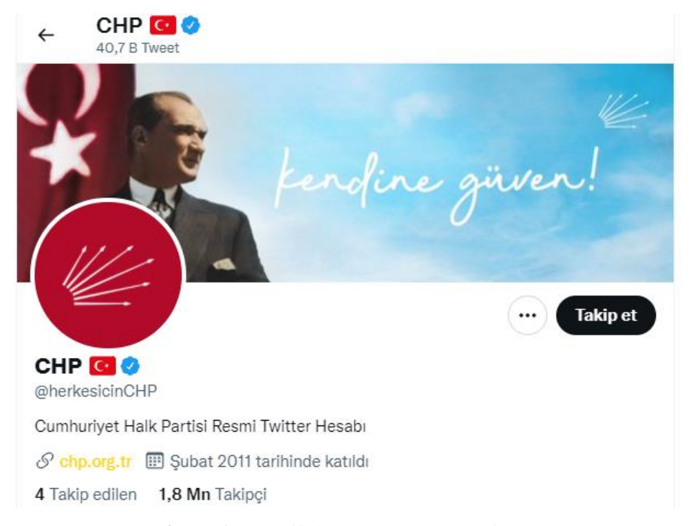
Figure 6. The Official Twitter Account of CHP