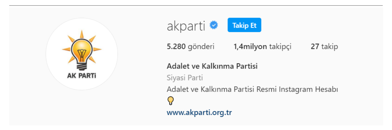
Figure 3. The Official Instagram Account of AK Parti