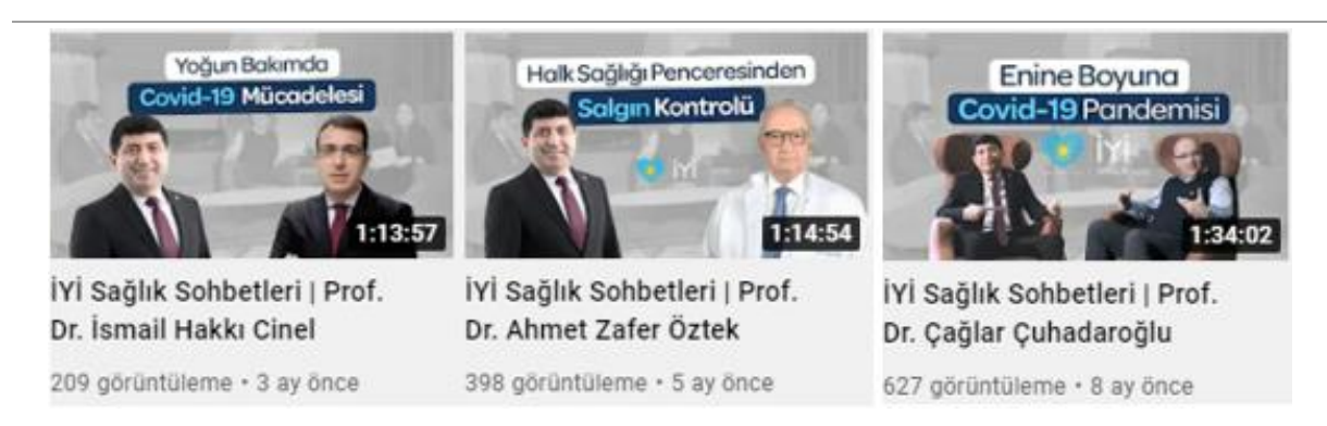
Figure 18. The Pandemic-related Video-Sharing Examples on the İYİ Parti Youtube Channel