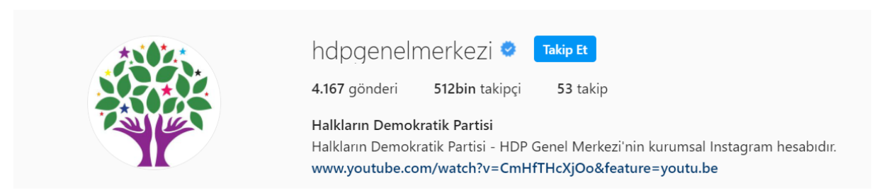
Figure 11. The Official Instagram Account of HDP