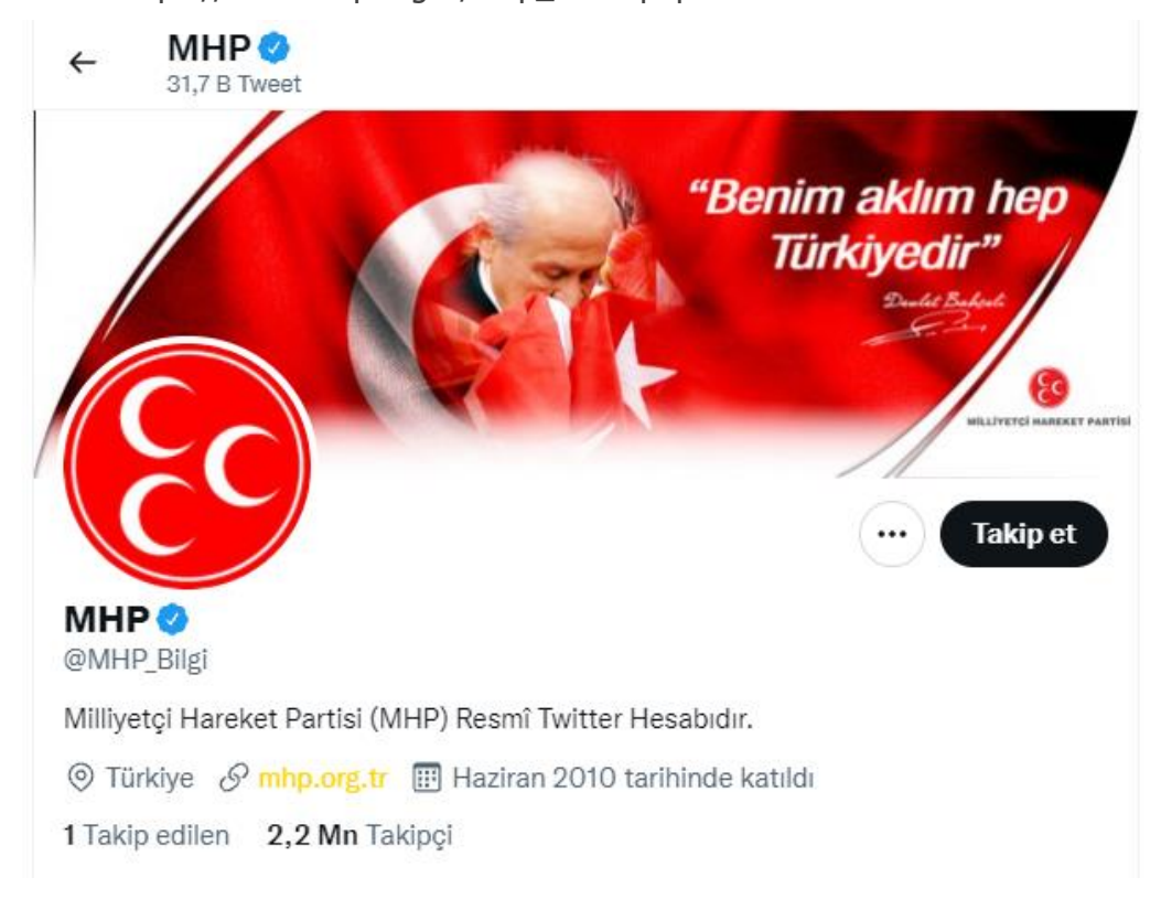
Figure 14. The Official Twitter Account of MHP