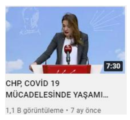
Figure 12. An Example of Sharing About Pandemic on CHP YouTube Channel

CHP deputies. However, there are no video shares directly related to the pandemic or coronavirus. Although there is some content about the pandemic period in the videos, the video headings do not include them remarkably.