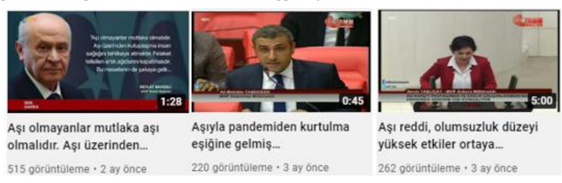
Figure 16. MHP Youtube Kanalında Pandemi Dönemine İlişkin Video Paylaşım Örnekleri

During the pandemic period, the MHP's YouTube channel videos have heavily been regarding the party leader's and deputies' press statements and political speeches, as in other parties. Although there are videos for raising public awareness of the pandemic, these videos have been in a limited number. The examples below are videos of this party posted to speed up vaccine efforts and encourage the public so that pandemic restrictions will not happen again.