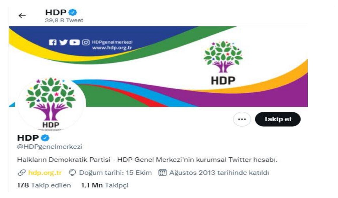
Figure 10. The Official Twitter Account of HDP