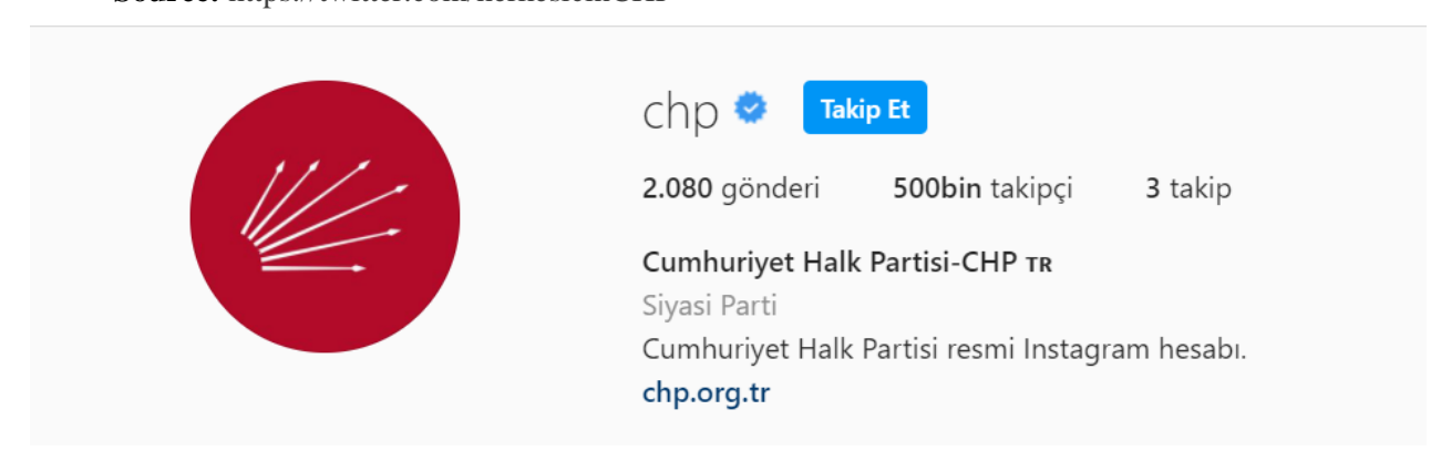
Figure 7. The Official Instagram Account of CHP