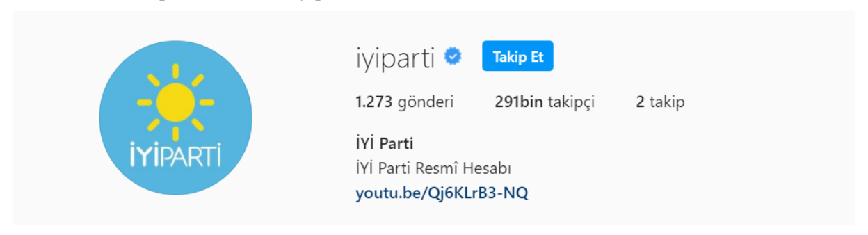
Figure 18. The Official Instagram Account of İYİ Parti