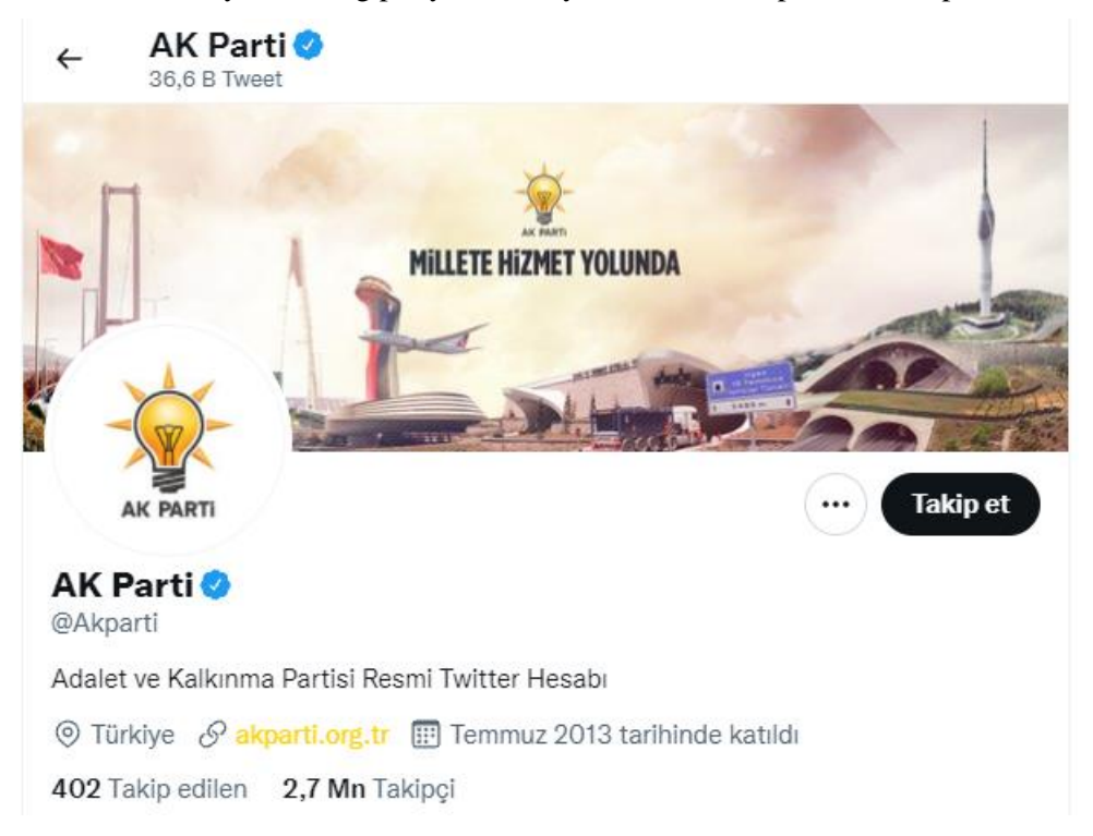
Figure 2. The Official Twitter Account of AK Parti

AK Parti is currently the ruling party in Turkey and has 287 deputies in the parliament.