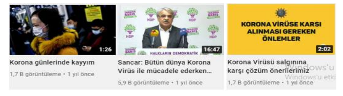
Figure 14. Examples of the Sharings posted on the HDP Youtube Channel in the Pandemic Period

During the pandemic period, the HDP YouTube channel has generally included the party's press statements and messages about the agenda. Although they share the pandemic issue inside the video contents, the names of the pandemic or coronavirus are rarely included in the video headings. The examples below show the video images where HDP criticizes the government's strategies and shares its views on the pandemic period in an oppositional language during the pandemic period.