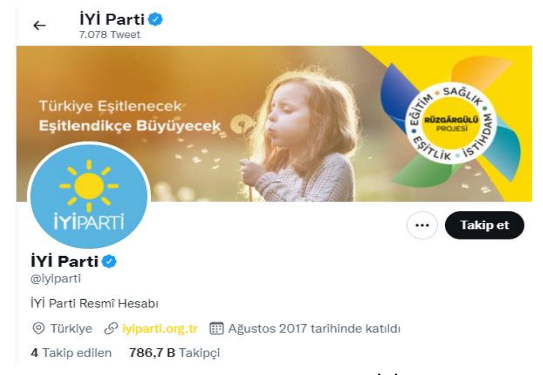
Figure 17. The Official Twitter Account of İYİ Parti