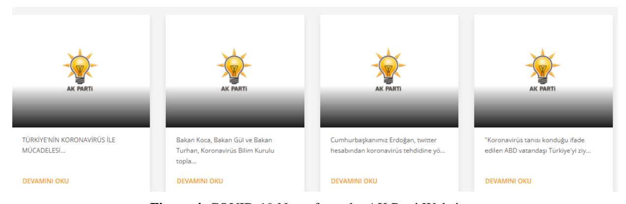
Figure 4. COVID-19 News from the AK Parti Website