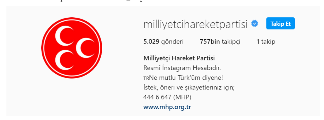
Figure 15. The Official Instagram Account of MHP