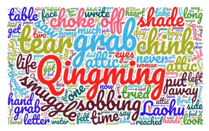
Figure 2. Wordcloud Created on www. wordclouds.com

families visit the tombs of their ancestors to commemorate. The students are encouraged to look up the definitions of more words they realize in the word cloud.