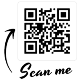
Figure 3. Paper Menagerie QR Code with the Letter in Chinese

These activities help students to understand the plot, the characters, the style and the language, and to come over lexical difficulties. Students are encouraged to work on the plot to construct their own meaning, the characters, the style and the language through while-reading activities. Before starting students are given the story a part of which was translated into Chinese in this study using Google Translation for a creative writing activity. In the original story, the letter is in English which will be handed out to students for further activities. Alternatively students are asked to scan the QR code to access the text in pdf, provided that the learners have smartphones to do so. QR codes can make the text accessible to the learners at any time and place, interesting and environmental-friendly.