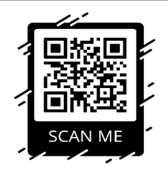
Figure 6. The QR Code for the Whole Book