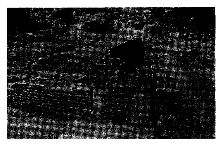
Fig. 1 — The bath-house complex from the south. In foreground(rt) the entrance to cool subterranean storage chamber.