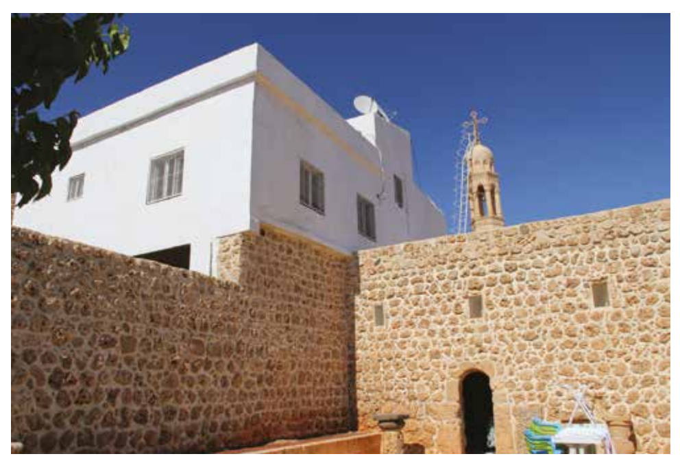
Figure 2 - Guest House of the village church of Sare. / Sare'deki köy kilisesinin Misafirhanesi.

Although there are a few exceptions, which we shall deal with in some detail below, funding for most of the repairs/ renovations came from the diaspora. The money was usually collected by foundations named after the villages from which their members come. The collected money usually went to the repair of the church in that particular village or was sent directly to the bishopric of Tur 'Abdin to be used where the bishopric thinks appropriate. It was a collaborative initiative with input from many people, whose names usually remained anonymous; as was