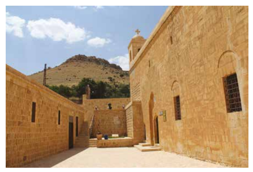
Figure 4 - Bust of the benefactor in the background in the church of Mor Gevargis in the village of Qal'at almar'a. / Qal'at almar'a köyündeki Mor Gevargis kilisesinde kiliseyi onaran kişinin arkaplanda görünen büstü.