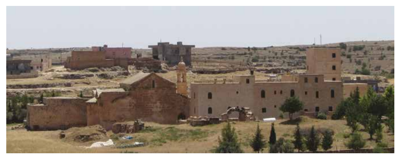
Figure 7 - The old and the new in the monastery of Mor Ya qub at Ṣālaḥ, from north. / Kuzeyden bakınca Ṣālaḥ taki Mor Ya qub manastırında eski ve yeni.