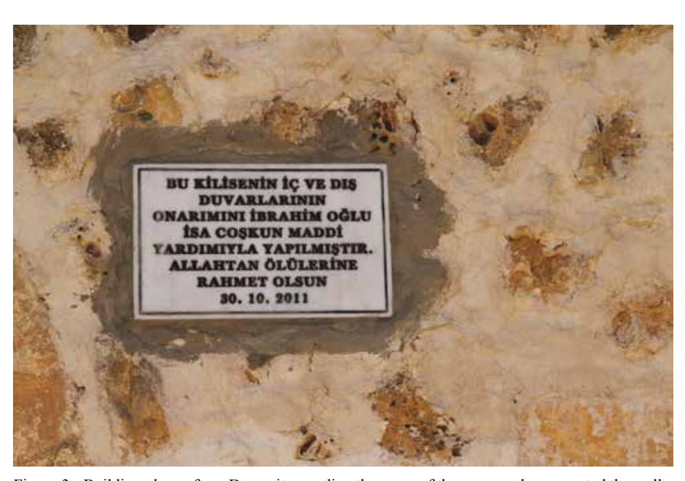
Figure 3 - Building plaque from Dargeçit recording the name of the person who renovated the walls. / Dargeçit'te duvarı restore eden kişinin adının kaydedildiği levha.

In many cases, the churches that were restored are those that had been abandoned and had remained closed for thirty to forty years. After the restorations which cost hundreds of thousands of liras, these churches were opened with big celebrations. For example in 2010, two thousand people celebrated for two days the opening of the Mor Eshoyo and Mor Kuryakos churches in Anhel. Syriac Christians from Iraq and Syria also attended