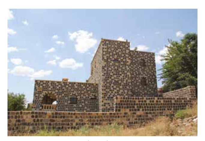
Figure 10 - Guest House in İdil. / İdil'de Misafirhane.

Properties decided on the demolition of the bell-tower and the annex built in the courtyard of the church of the village of Zāz (Fig. 9)<sup>4</sup>. The decision was not executed.