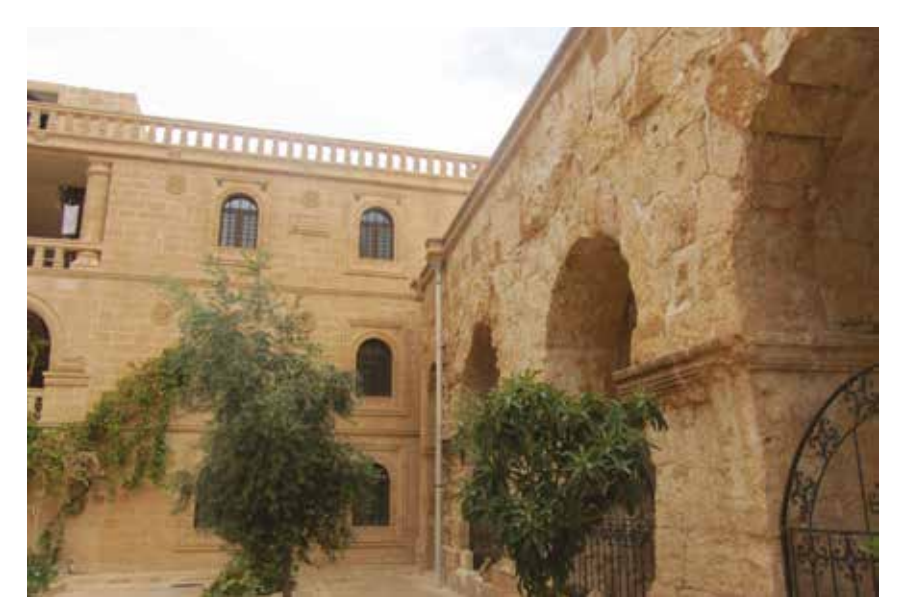
Figure 8 - The church and annexes in the monastery of Mor Ya 'qub at Ṣālaḥ. / Ṣālaḥ 'taki Mor Ya 'qub manastırının kilisesi ve ek binaları.

In some important churches or monasteries the new structures compete with the old churches in scale. For example the three-storey guest house in Mor Ya qub at Ṣālaḥ is higher than the 6th century church next to it and together with the gigantic water tower, it affects the silhouette of the monastery dramatically (Figs. 7 and 8). Although these large concrete structures were built next to it, the spectacular 6th century church in the monastery was left untouched. It was acknowledged that it should receive professional attention. The monks in charge of the construction work have great dedication and emphasized that in the past they were ashamed of the bad state of their buildings. In the case of the church of el Adhra at Ḥāḥ, defined as the "crowning glory" of the Tur 'Abdin by Gertrude Bell, projects were prepared for the construction of an additional building to the church. However, some of the members of the diaspora community asked the