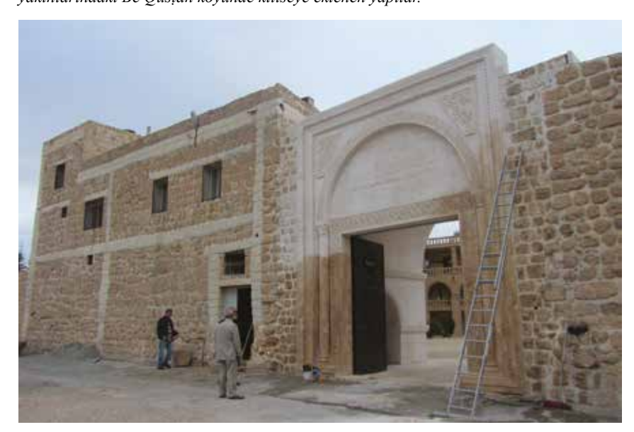
Figure 6 - Entrance to the monastery of Mor Ya 'qub at Ṣālaḥ. / Ṣālaḥ 'taki Mor Ya 'qub manastırının girişi

the celebrations. The community who participated in the opening emphasized the symbolic importance of these restorations which would keep alive the hope that those who migrated to various countries of Europe might return. The participants also claimed that until now, the repairs and works had been due to personal initiatives but that from now on it would be rather a collective act of those who wanted to come back and live in their land<sup>2</sup>.