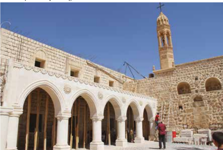
Figure 5 - Additions to the church of the village of Be Qusṭān near Ḥāḥ. / Hah yakınlarındaki Be Qusṭān köyünde kiliseye eklenen yapılar.