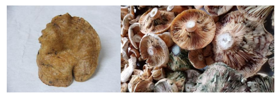
Figure 1. Surface and inside photograph of the L. semisanguifluus

A total of 20 kg L. semisanguifluus were collected from Keles, Bursa in Türkiye (39°52'N 29°12'E). The Figure 1 shows the photograph of the L. semisanguifluus . The altitude of this location is 1200 m which is the neighbour of Uludag mountain. The forest in the area where the mushrooms are collected; it consists of pine, oak, hornbeam, hawthorn, and occasionally poplar and plum trees. When the mushrooms were collected, it was noted that they were in the same maturity levels with the uniform shape, size, and health conditions to provide homogeneity.