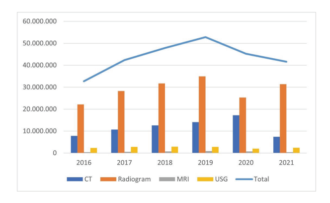
Figure 2. Distribution of emergency imaging and imaging modalities by years