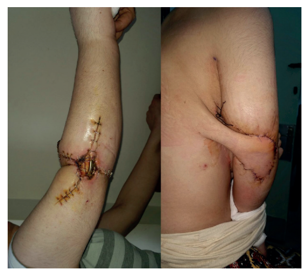
Figure 3. A case with an exposed elbow arthrodesis plate after resection of a giant cell tumor. Exposed flap was covered with a pedicled thoracoabdominal flap

As mentioned previously, we reserved the term thoracoabdominal for random pattern flaps emerging from the chest and abdominal wall. The term thoracoabdominal is nonspecific and does not state the orientation or vascularity (Fig. 3).