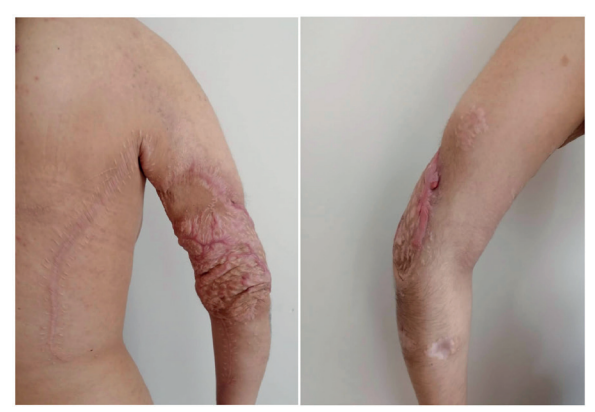
Figure 5. The case presented in Fig. 4 eleven months after wound coverage with pedicled latissimus dorsi musculocutaneous flap

posed muscle rather than a subcutaneous tunnel to avoid pressure on the pedicle.