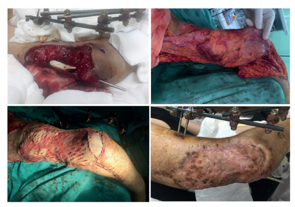
Figure 4. A case with an open elbow fracture resulting from a motor vehicle accident. Ulnar nerve defect was reconstructed with a sural nerve graft and the soft tissue defect was covered with a pedicled latissimus dorsi musculocutaneous flap and split thickness skin graft

LD can be used as a muscle flap with skin grafting over the muscle, and it can be used as a myocutaneous flap with a skin island overlying the muscle (Fig. 4, Fig 5). The island can be designed obliquely or transversely in women to hide under the brassiere. Skin islands as large as 8x20 cm can be closed primarily. The anterior transposition can reach 8.4 cm distal to olecranon, while the posterior transposition can reach up to 6.5 cm distal to olecranon. Stevanovic et al recommend incising the skin overlying the trans-