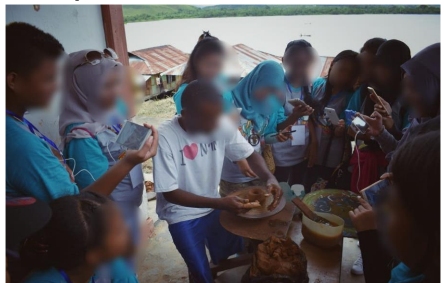
Figure 2. Example of school trip in a cultural village in Papua Province, Indonesia

However, some recent data show an optimistic picture in the development of this type of tourism model globally. In in the context of Asian countries such as Japan, it is indicated that in 2012, 98.4% of junior high schools and 97.1 % high schools execute school trips, organized during the third year of school, with the majority of the destinations being domestic (Watanabe, 2015). Although this has slightly decreased due to economic challenges in 2013 (to 96.9%), 134,007 high school students were involved in overseas school trips.