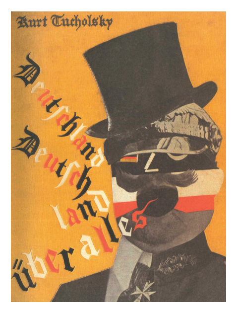
Figure 1. Cover Image of DD. (Tucholsky & Heartfield, 1929)

DD's front cover can leave readers puzzled about its meaning. The photomontage contains Wilhelmine, military and bourgeois symbols that come together in an imaginary portrait to comment on Weimar Germany's unstable and unclear leadership (Figure 1).