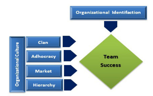
Figure 1. Conceptual Model of Research

As mentioned before, the purpose of this research is to examine the impact of organizational identification and organizational culture on team success. The conceptual model of the research is shown in Figure 1.