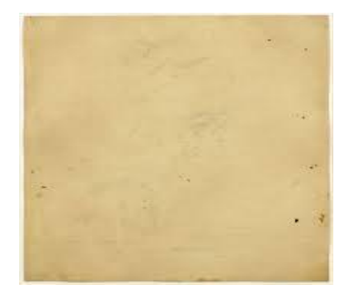
Figure 3: Robert Rauschenberg, Erased De Kooning Design, 1953.