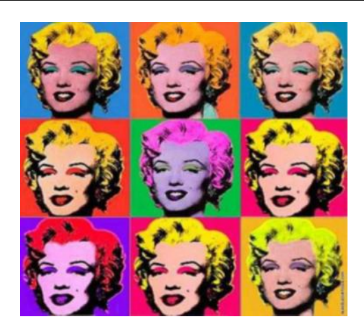
Figure 5: Andy Warhol, Nine Marliyns, 1963.