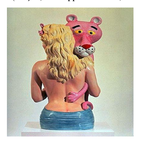
Figure 1: Jeff Koons, Pink Panther, 1988

Although using creativity and creating original and authentic works are very important for modernists, it is very senseless for postmodernists. Postmodern artists advocated that all the methods have been used, it is not important to seek after new movements in art, and avant-garde has lost its validity. However, kitsch that has been deemed worthless by modernism has been considered an esthetical component for the postmodern art approach (Selçuk, 2011: pp.3885-3886).