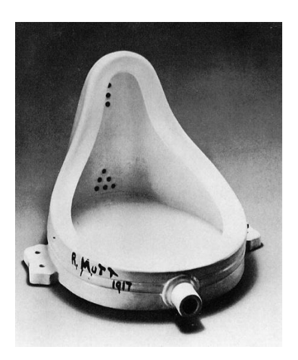
Figure 2: Marcel Duchamp (1917), Fountain, Porcelain urinal, Modern Arts Museum, New York.

Furthermore, in the art of the 20<sup>th</sup> century when different concepts and approaches have been observed, the meaning and value assigned to the usage object made the "commodification" problem and dignity esthetic of modern art to be questioned and criticized. Marcel Duchamp's ready-made objects can be given as examples of this. The principle of "dignity of esthetic", which was criticized by Duchamp by signing an ordinary usage object, has integrated the art and daily life and designed the route of postmodern art. This riot against the principles and esthetic values of modern art has directed the formation of conceptual art and the esthetical values have been replaced by the ideas and thoughts (Şahin, 2013: p.239).